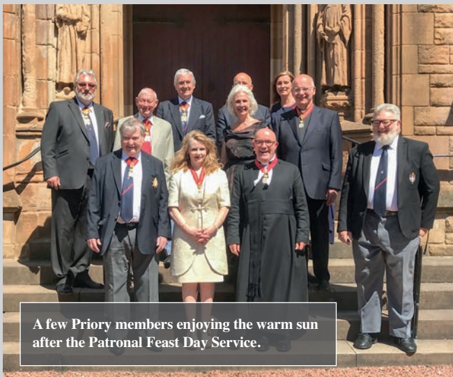
A few Priory members enjoying the warm sun after the Patronal Feast Day Service.