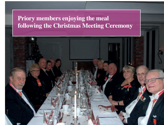
Priory members enjoying the meal following the Christmas Meeting Ceremony

The Priory of Norway has had a busy autumn this year, including a Ceremonial meeting in Ila Church in September for the Installation of the new Prior and his Council, conducted by the Grand Commander, and we pleased to also have a visitor from Denmark.