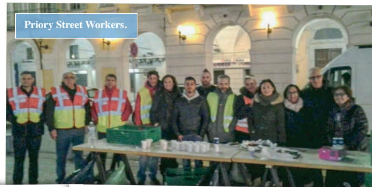
Priory Street Workers.