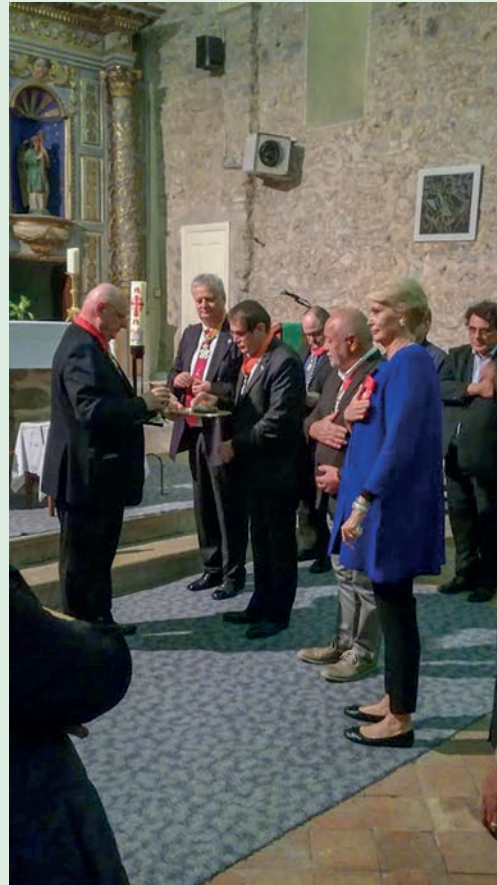
Photographs taken at the Chapter Meeting at "Notre Dame des Grâces".

right hand on the heart, for both selected themes : "Charity" and "Saint John the Baptist".