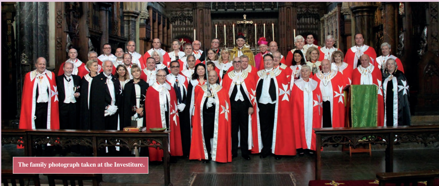
The family photograph taken at the Investiture.