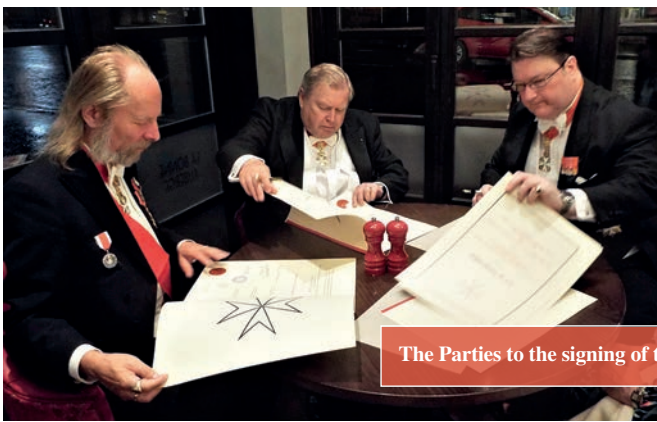
The Parties to the signing of the Act of Integration in Glasgow.