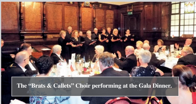
The "Brats & Callets" Choir performing at the Gala Dinner.

The Gala Dinner, which followed the Investiture service, was held in the magnificent Trades Hall, home to The Trades House of Glasgow and its 14 Incorporated Crafts and, apart from the medieval cathedral, is the oldest building in Glasgow still used for its original purpose. During the evening the assembled gathering enjoyed some wonderful singing by three wonderful young tenors who sang some popular operatic arias and were also entertained to the singing talents of the superb Brats & Callets Choir from Strathaven who provided their services absolutely free of charge.