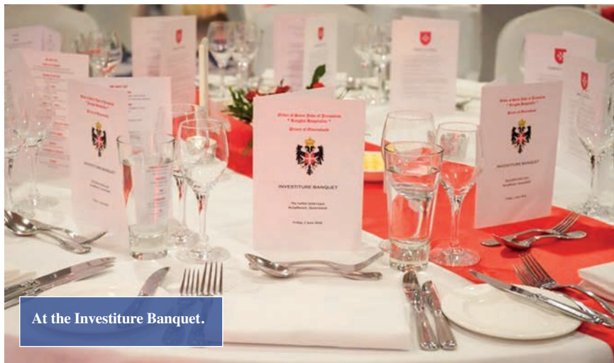
At the Investiture Banquet.