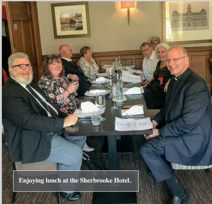
Enjoying lunch at the Sherbrooke Hotel.