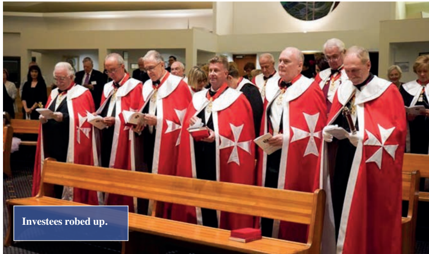
Investees robed up.