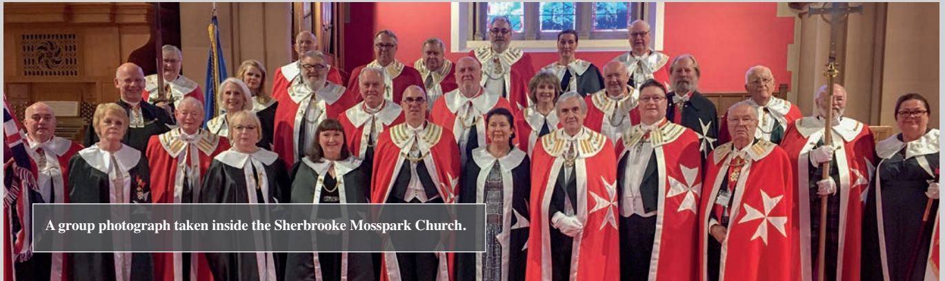
A group photograph taken inside the Sherbrooke Mosspark Church.