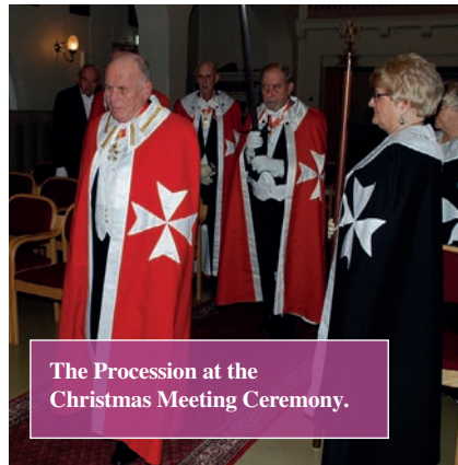
The Procession at the Christmas Meeting Ceremony.