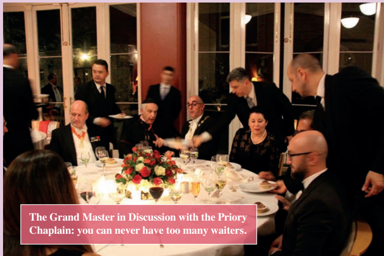
The Grand Master in Discussion with the Priory Chaplain: you can never have too many waiters.

O Quam Gloriosum; Ludovico Grossi da Viadana's Exultate Justi; and Hans Leo Haßler's Dixit Maria.