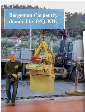
Bergemon Carpentry donated by OSJ-KH.