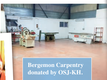
Bergemon Carpentry donated by OSJ-KH.