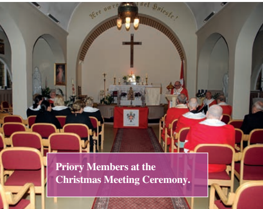
Priory Members at the Christmas Meeting Ceremony.