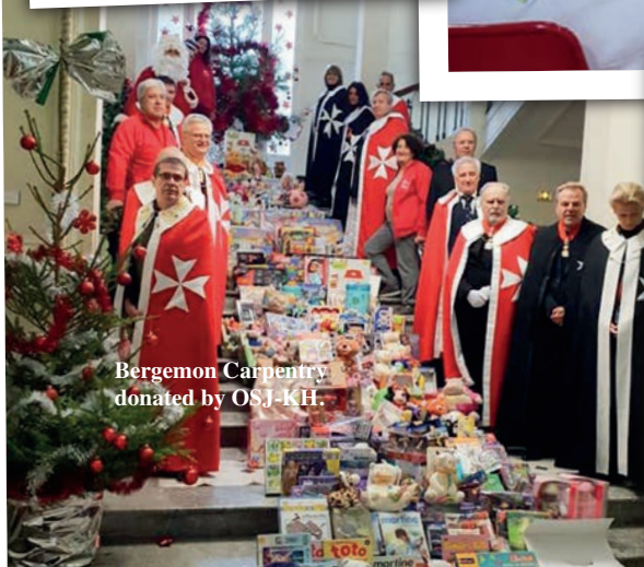
Bergemon Carpentry donated by OSJ-KH.