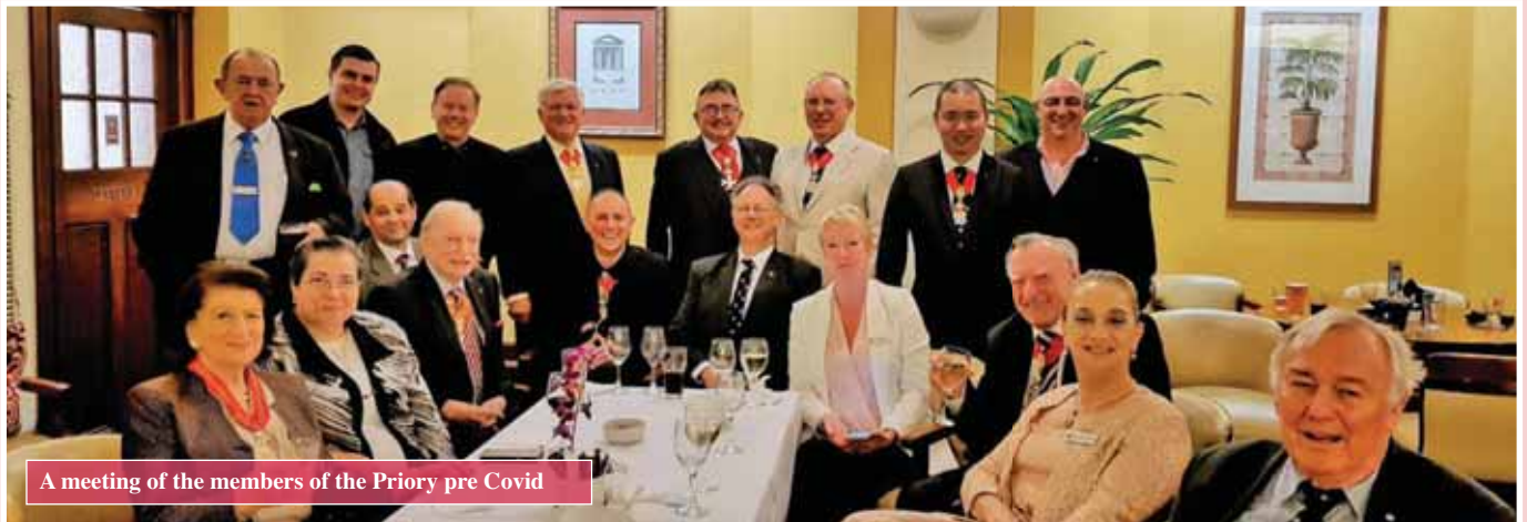
A meeting of the members of the Priory pre Covid