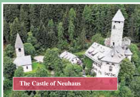
The Castle of Neuhaus