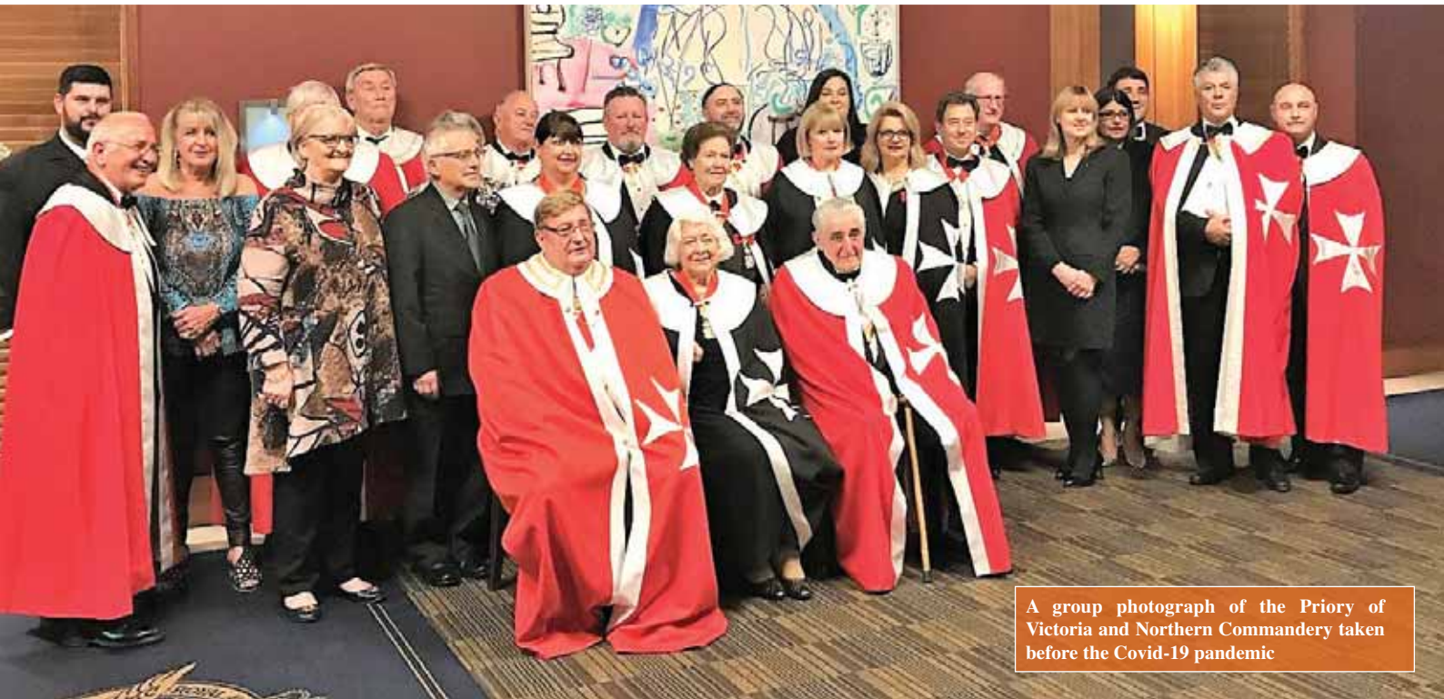
A group photograph of the Priory of Victoria and Northern Commandery taken before the Covid-19 pandemic

In the Priory of Victoria we are keen to build our membership and structure and we have therefore produced an introductory program, which includes a brochure and short introductory DVD. The program will be used for presentations to groups, including groups of prospective Serving Brothers and Sisters. The main purpose is to give interested parties an understanding of the history of the Order and the aims and objectives of our modern day Order of St John. We are also recording DVD's of past Investitures, and events at which past Grand Masters, Grand Commanders and senior members have been involved, even including an interview with one of the four eminent officers involved in helping to draft the 1964 Constitution.