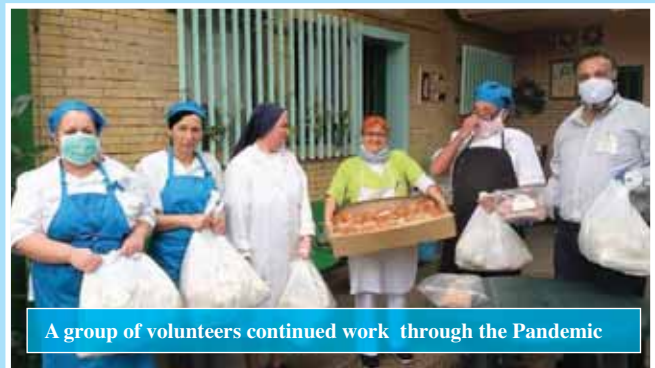
A group of volunteers continued work through the Pandemic