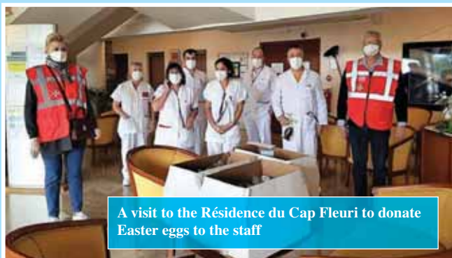
A visit to the Résidence du Cap Fleuri to donate Easter eggs to the staff