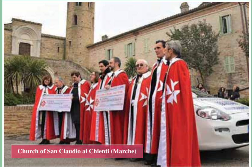
Church of San Claudio al Chienti (Marche)

In common with all Priories worldwide we have had to face up to the impossibility of organizing chivalrous or charitable events or to physically go to provide assistance to the areas in need, and this has greatly influenced the activities of the Priory of Italy during the first six months of 2020.