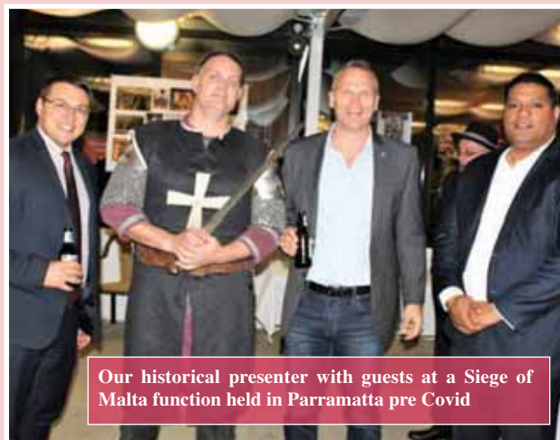
Our historical presenter with guests at a Siege of Malta function held in Parramatta pre Covid

important field of research is given on the website https://news.griffith.edu.au/category/institute-for-glycomics/ . Griffith University is located in Queensland with its largest campus in Southport on the Gold Coast. The Priory of Queensland will continue with their ongoing support to this worthy cause.